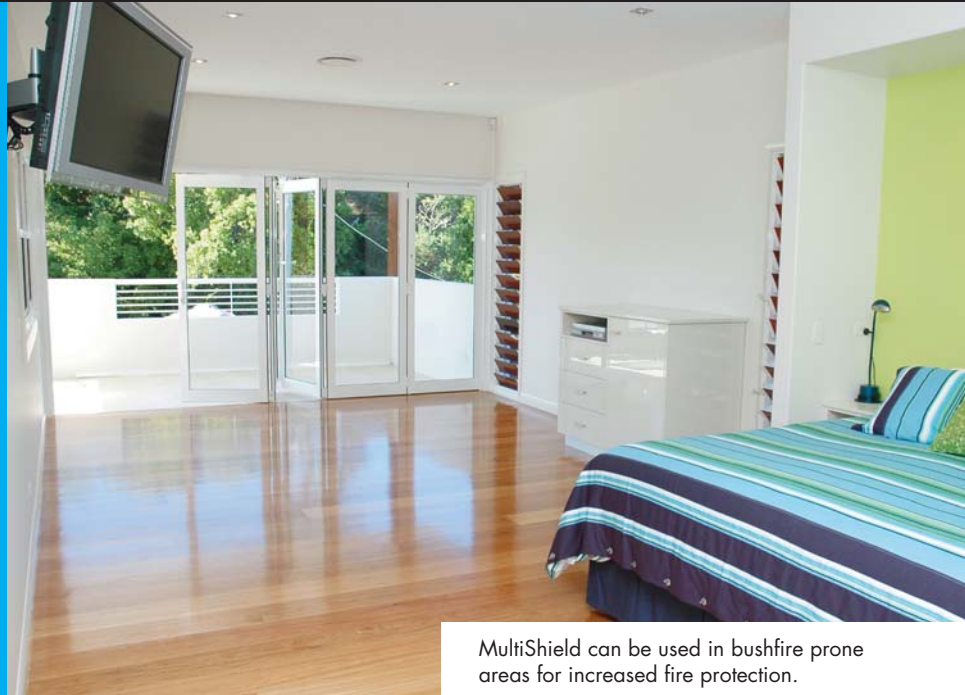
MultiShield can be used in bushfire prone areas for increased fire protection.

MultiShield is a plasterboard with the combined benefits and properties of FireShield and WaterShield. It is suitable for use in wet areas where a Fire Resistance Level (FRL) is required. MultiShield has recycled blue liner paper.