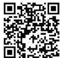
SCAN & EMAIL ME