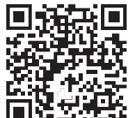
SCAN & EMAIL ME